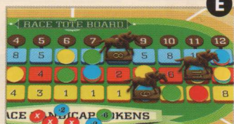
8 Wins, 11 Places, 9 Shows

The first horse to pass the finish line goes onto the board on the Win line under its' number space. The 2 nd finisher goes to its' space on the Place line and likewise the 3 rd finisher goes to its' space on the Show line. (See E )