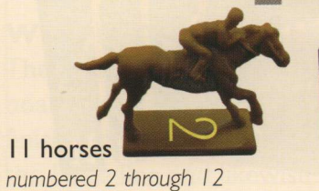
11 horses numbered 2 through 12