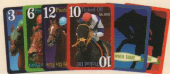
33 Owner Share cards 3 share cards for each horse, 2 in the blue deck & 1 in red